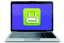
Print from your laptop or desktop computer